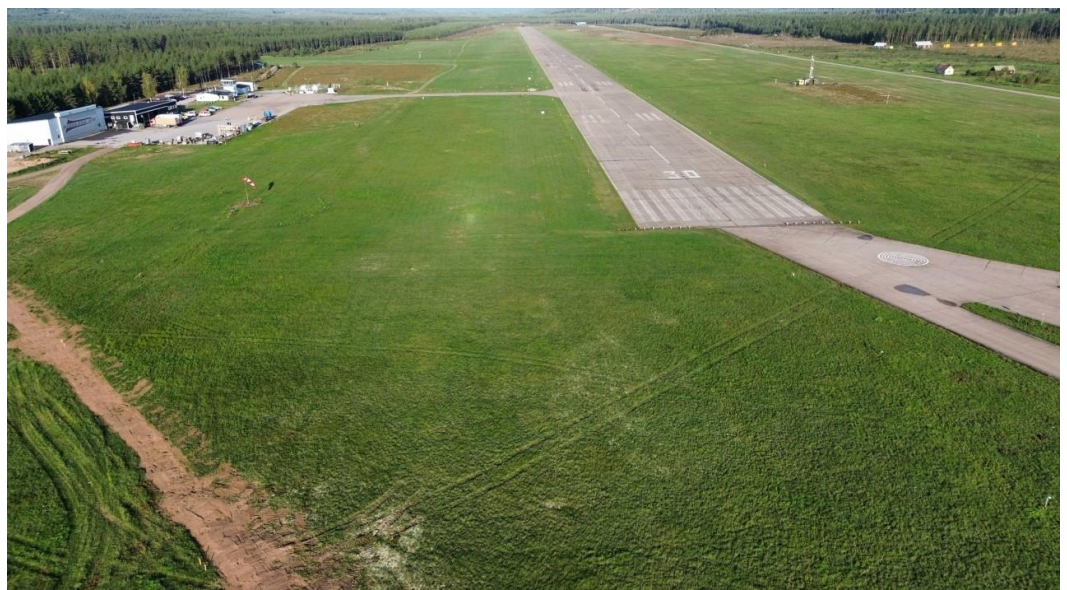
Site- and project management from Solkompaniet and Bouygues Energies & Services at Hultsfred airport

Alongside this construction contract, Bouygues Energies & Services and Solkompaniet will also be responsible for maintaining the site for the next 20 years.